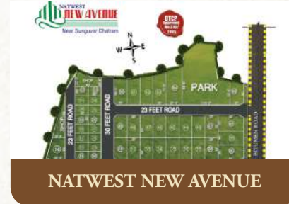
NATWEST NEW AVENUE

DTCP approved layout close to Hyundai Factory on Bengaluru Highway Mevalurkuppam