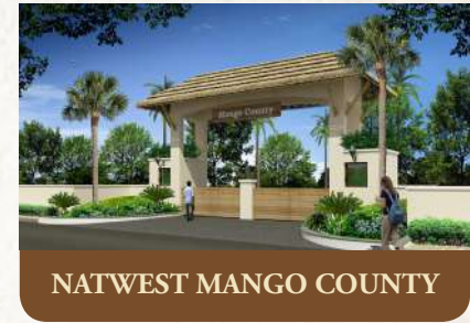
NATWEST MANGO COUNTY

18 specially crafted LUXURY Apartments In Velachery with all life style amenities