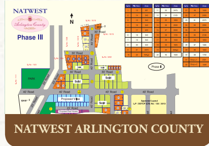
NATWEST ARLINGTON COUNTY

Gated Community of Plots & Villas amidst the serene nature with club house facilities in about 100 acres near THIRUVALLUR