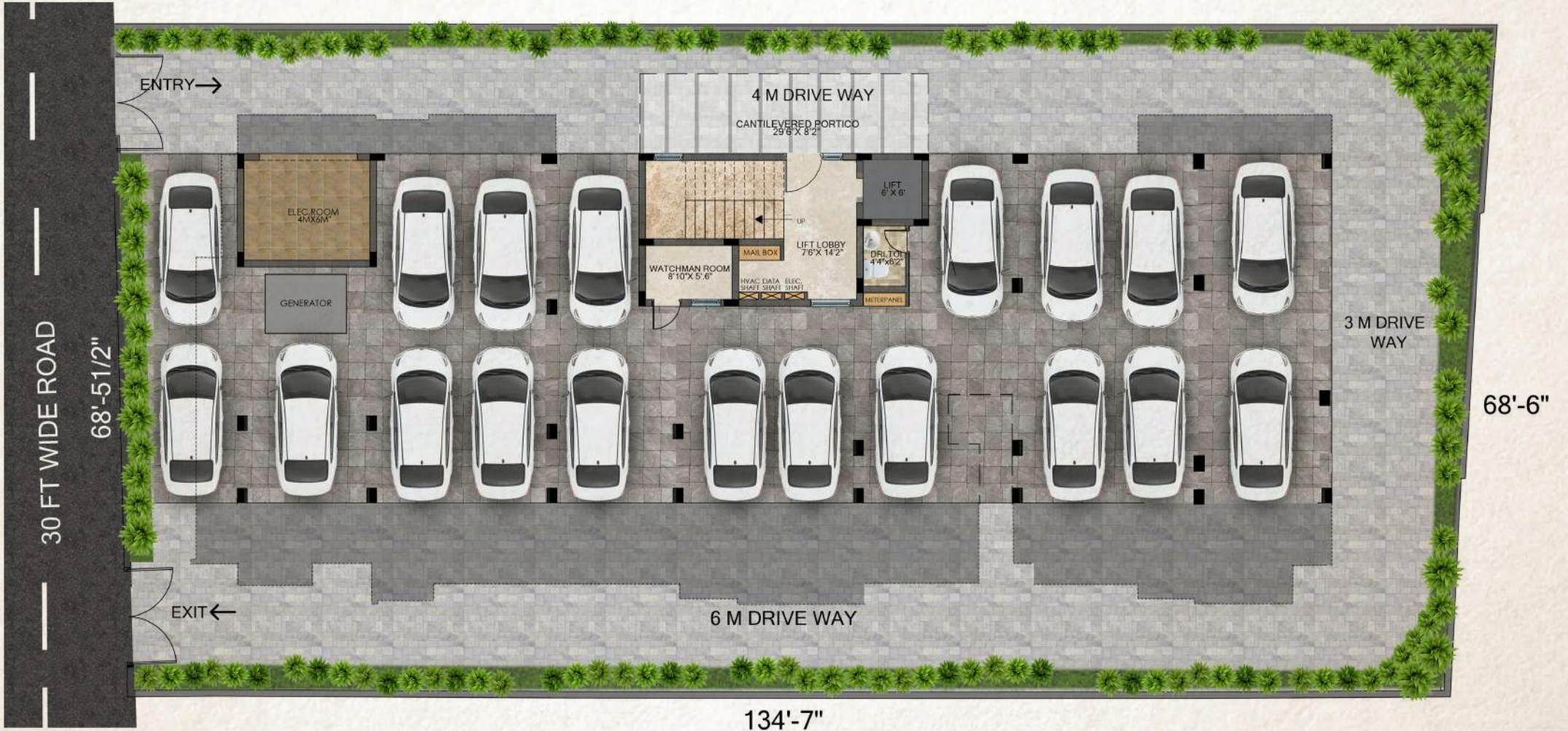
SITE/STILT FLOOR PLAN (Practical Car Parking)